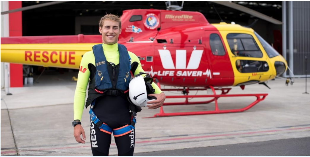
Lifesaving Volunteers to the Rescue!