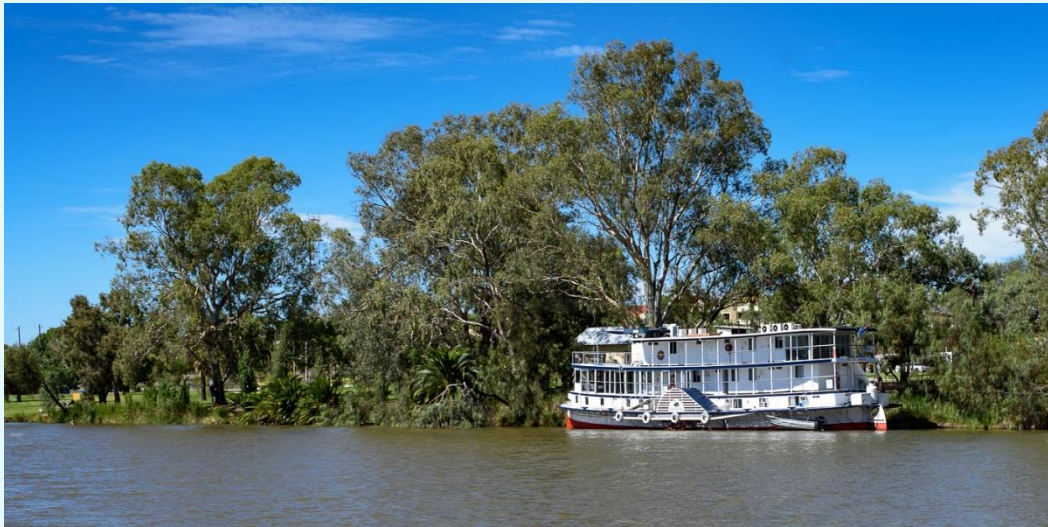
Life on the Murray River