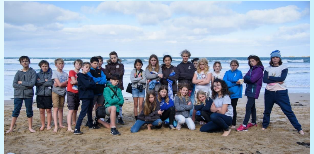
Everyday Lifesavers – Responding to an Emergency